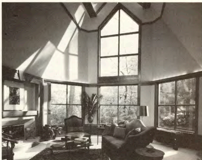
The "H" Window, or "housemother's window," from The H Window Co., allows you to flip the entire panel 180 degrees to make cleaning a breeze.

But before you buy, take some time to examine how you live in your house throughout every season, especially winter. Not just a cosmetic touch, windows do much more than simply lend a pleasing balance to the exterior of a house. Much research has been published about SAD, or seasonal affective disorder, confirming what we've all suspected about winter: that light deprivation, especially in northern climes, can