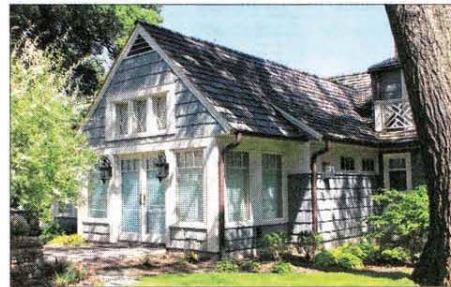
Provided by Rich Laffin Architects

Where does he stand? "It's less about traditional or modern and more about whether the designer used good design principles, and it fits the scale and proportion of the existing house," he said. "I only find it objectionable when it's obnoxious."