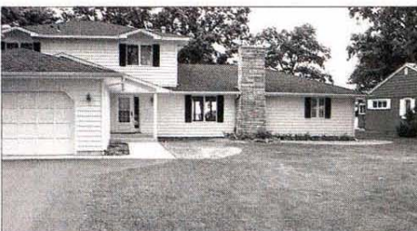
ABOVE The rambler before the expansion. RIGHT An Asian-inspired addition by McMonigal Architects combines elements matching the existing home with its own distinct style.