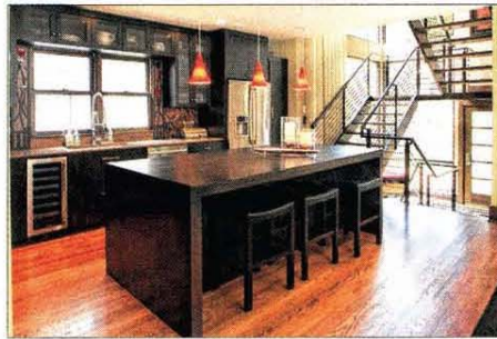
RIGHT The project included a two-story stair tower on the back.